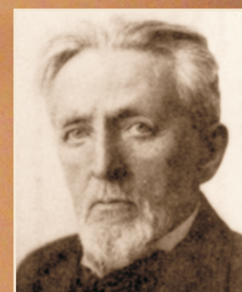
Third Hans Horst Meyer Award 2007