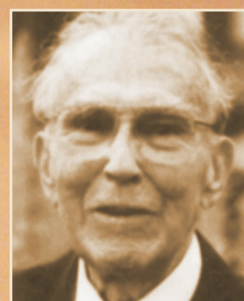
First Heribert Konzett Award 2007